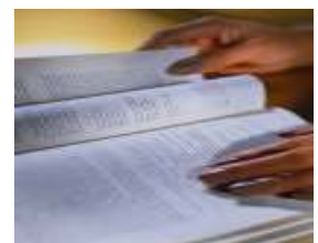
2 Timothy 2:15